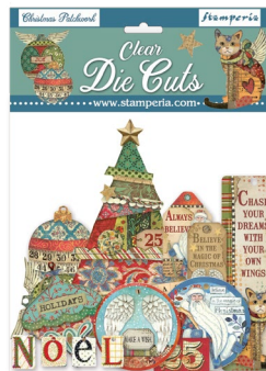
41 pcs DFLDCP08