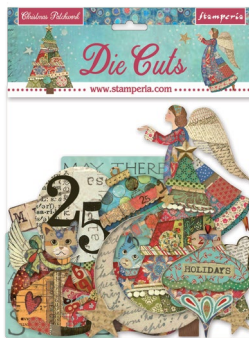
79 pcs DFLDC43